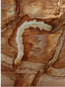
EAB larvae damage the vascular system of the tree as they feed, which interferes with movement of systemic insecticides in the tree.

Application protocols and conditions of the trials have varied considerably, making it difficult to reach firm conclusions about sources of variation in efficacy. This inconsistency may reflect the fact that application rates for soil-applied systemic insecticides are based on amount of product per inch of trunk diameter or circumference. As the trunk diameter of a tree increases, the amount of vascular tissue, leaf area and biomass that must be protected by the insecticide increases exponentially. Consequently, for a particular application rate, the amount of insecticide applied as a function of tree size is proportionally decreased as trunk diameter increases. Hence, application rates based on diameter at breast height (DBH) may effectively protect relatively small trees but can be too low to effectively protect large trees. Some systemic insecticide products address this issue by increasing the application rate for large trees.