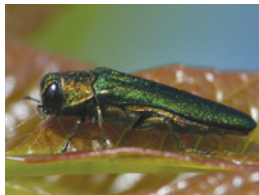
EAB adults must feed on foliage before they become reproductively mature.

The basal trunk spray offers the advantage of being quick and easy to apply and requires