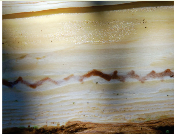
Ash Cambium Miner

Exit holes are not evident on outer bark.