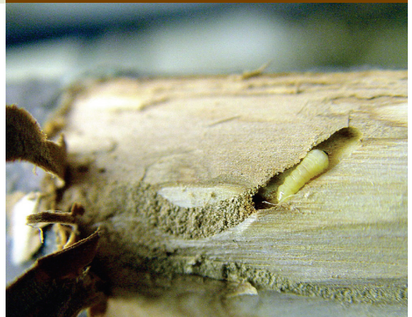
Redheaded Ash Borer