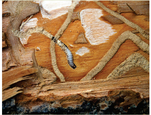
Redheaded Ash Borer tunnels (and prepupa)

Round exit holes are evident on the outer bark.