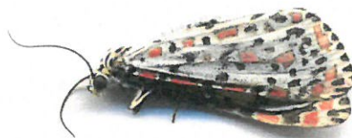
Ornate bella moth