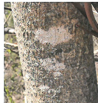
Lichen on bark