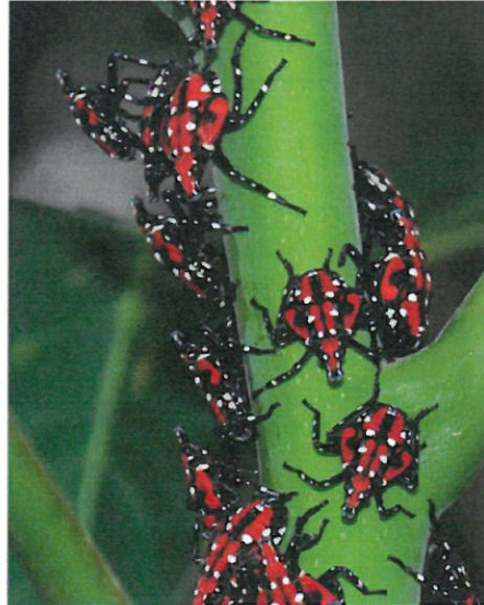
Older spotted lanternfly nymphs Eric Day, Virginia Tech