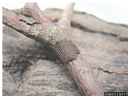
Cankerworm eggs