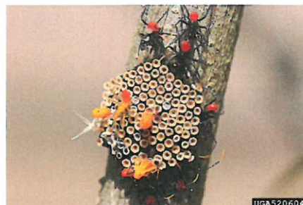
Wheel bug eggs and nymphs