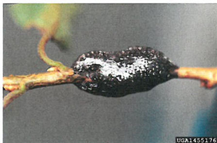
Eastern tent caterpillar eggs