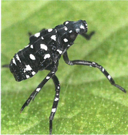
Young spotted lanternfly nymph

Immature spotted lanternfly, Lycorma delicatula (White), are black with white spots when young. They turn red and black with white spots when older. A few other insects in Virginia have similar color patterns, but a close look will show that immature spotted lanternflies are easily recognizable. Sizes not to scale.