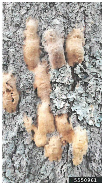
Gypsy moth egg masses covered with brown hairs.