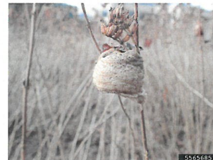
Chinese mantis egg case