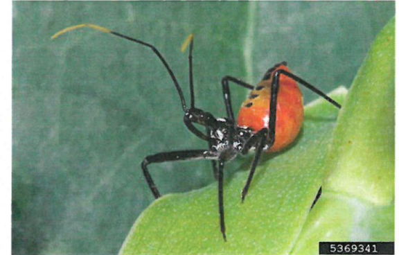
Wheel bug nymph