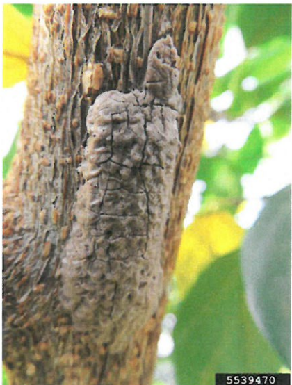
Spotted lanternfly egg mass

Egg masses of the spotted lantern fly, Lycorma delicatula (White), are usually covered with a smooth tan to gray colored coating when fresh. This coating may crack and fall off with age, exposing eggs laid in vertical rows underneath. Some egg masses are laid with only some or no covering at all. Here are a few other insect egg masses found in Virginia to help you recognize those of the spotted lantern fly. Sizes not to scale.