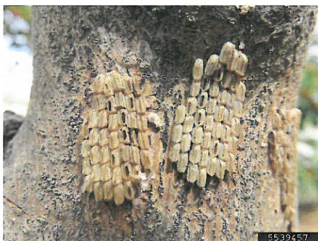
Spotted lanternfly eggs without covering.