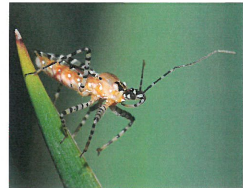
Assassin bug nymph