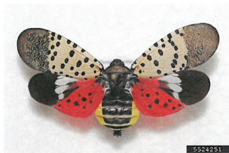
Spotted lanternfly, wings extended